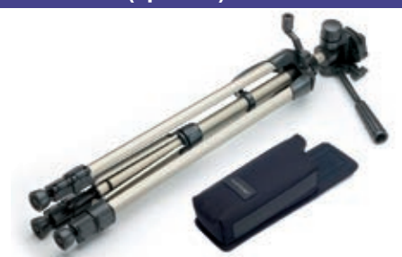
Tripod adapter, tripod, calibration certificate, belt pouch.